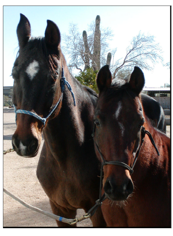
Dajen (Saddlebred/Standardbred, son of Wing Commander) and Khrumpet II (Arabian, son of Khemosabi)